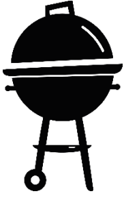
der Kugelgrill, -s