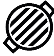
der Grillrost, -e