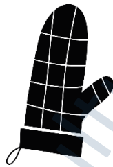
der Handschuh, -e