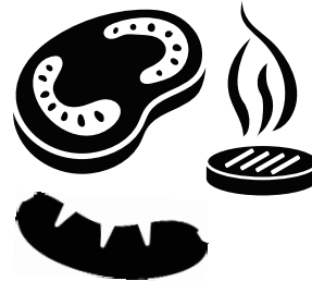
das Grillgut, -"er ( die Bratwurst, -"e das Steak, -s der Grillkäse, -)