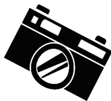
die Digitalkamera, -s