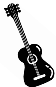
die Gitarre, -n