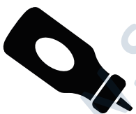
die Grillsoße, -n