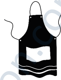
die Schürze, -n