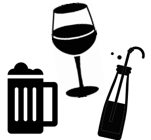
das Getränk, -e ( der Wein, -e das Bier, -e die Limonade, -n)