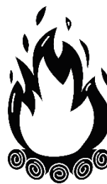
das Lagerfeuer, -